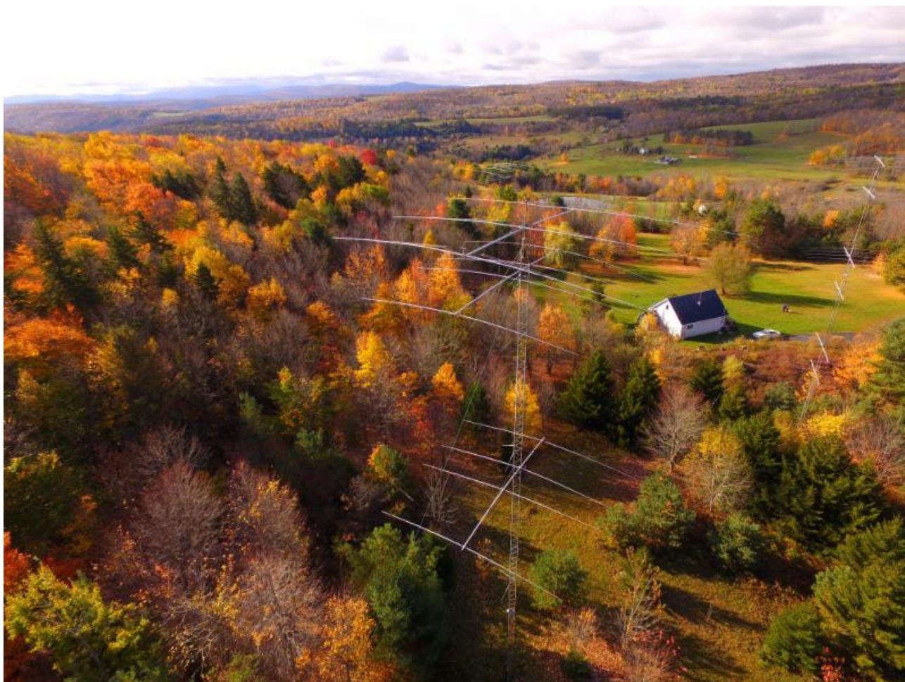
W2/Summit sitting at 2200' in the Catskill Mountains!

Welcome to the Autumn 2015 Edition of the RemoteHamRadio Newsletter. November is here and we have a lot of good stuff coming your way this DX season!