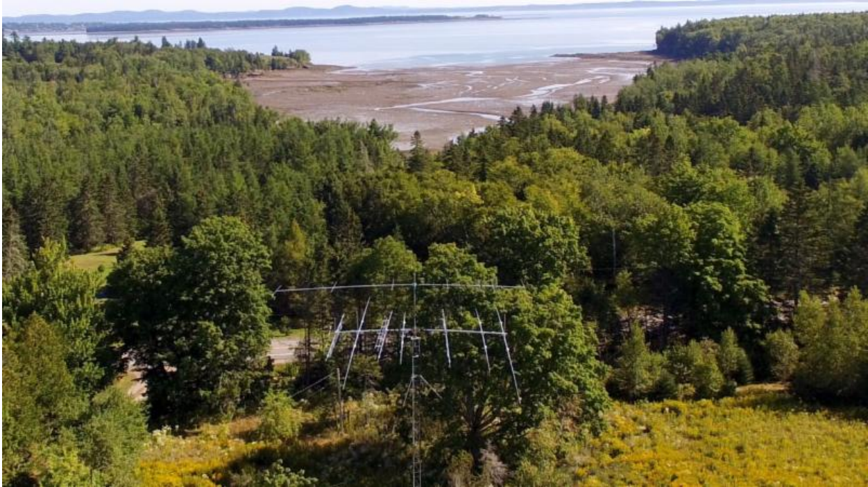
W1/Eastport - Low Tide on the Bay of Fundy!