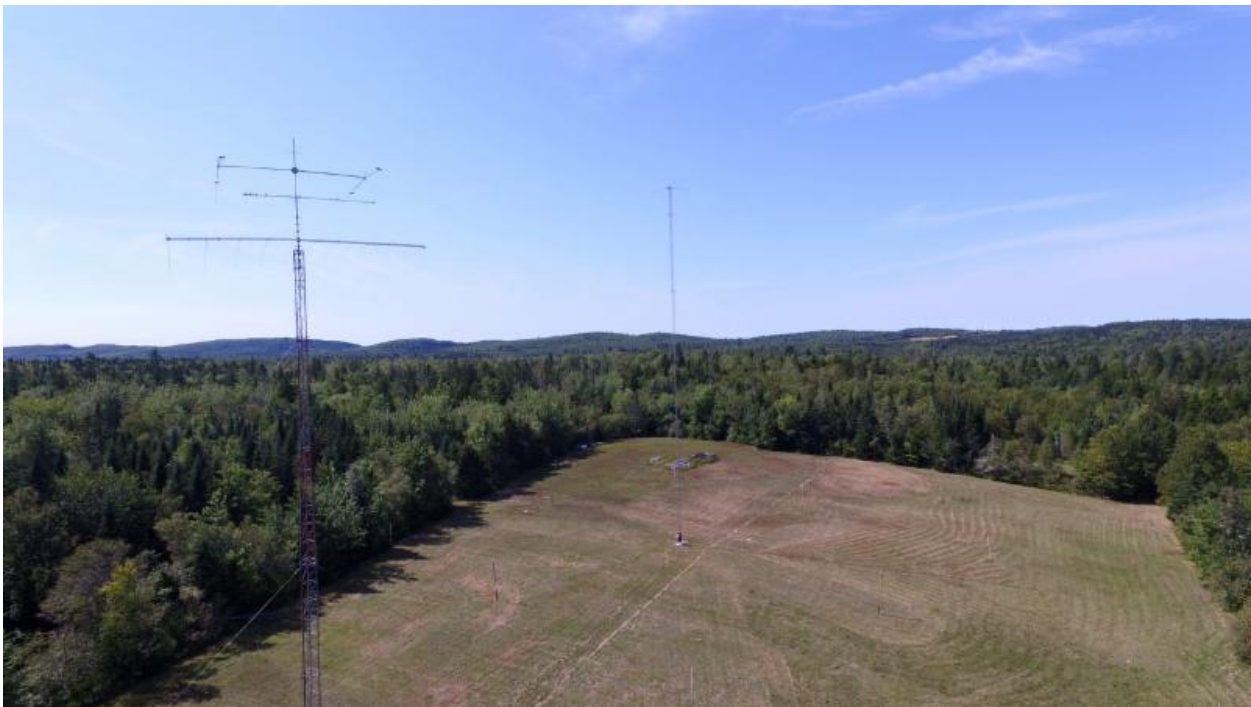
W1/Calais (Sitting 200' above Bay of Fundy) Incredible takeoff over the sea toward Europe!