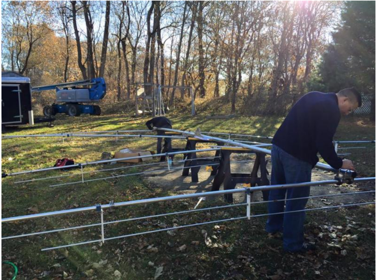
GXP 5B 4L Multiband Yagi