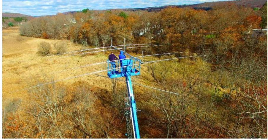
GXP Duobander 30/40.

New antennas are Duo- bander GXP 2EL 30/40M yagi @ 85' and a GXP 5B 4EL multiband yagi @ 75'.