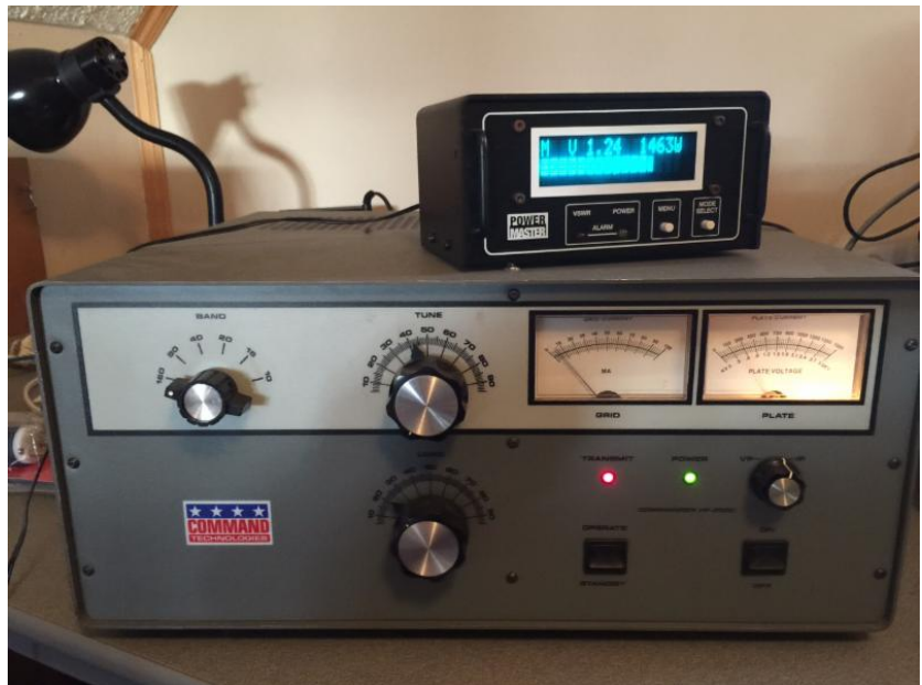
QRO Power on 160M with 4SQ array at 2200' ASL

It's that time of year again, we have the dedicated top band station up and running. This 1.5KW connected to a 160m four square sitting at 2300'ASL is simply a flame thrower into the Europe. The QRO + the gain of the array produces approximately 5KW of ERP that you can point in four directions. The leaves fall early in summit!