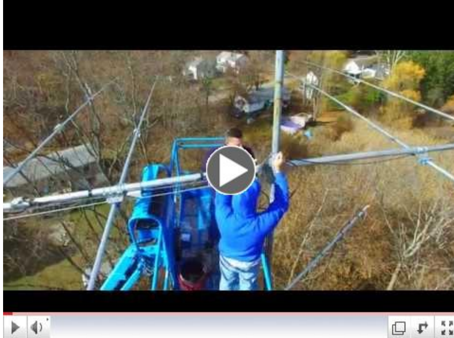
The RHR Team installing the GXP 30/40