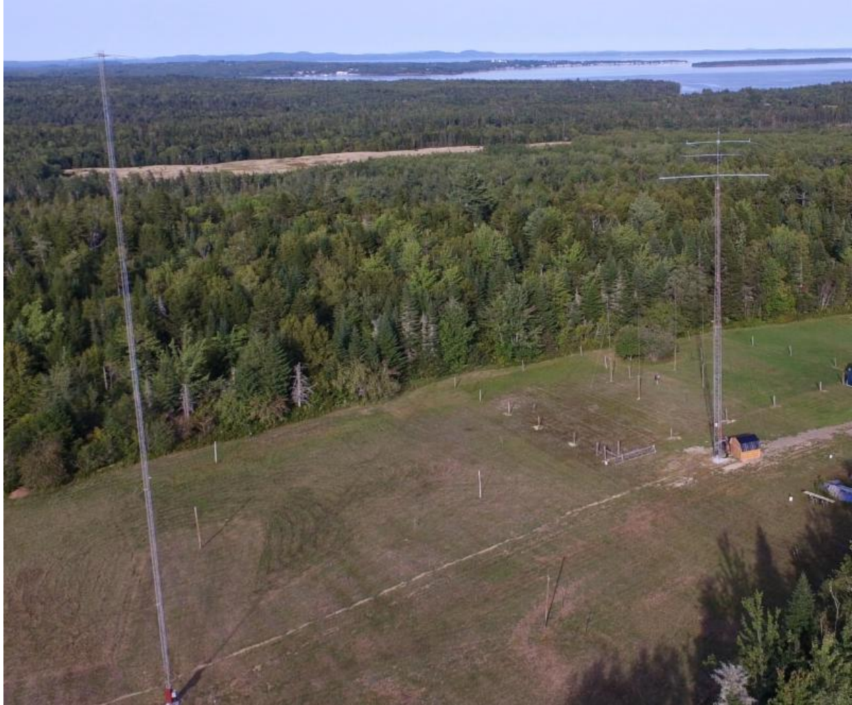
W1/Calais Maine sitting 200' above the Bay of Fundy